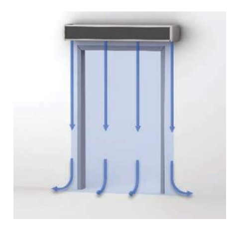
An example of a non-recirculating air curtain

They emit air from a discharge grille at the top of the opening and return it from the floor of the doorway. Air is returned through ductwork to the discharge grille. The non-obtrusive wide stream of low-velocity air created by recirculating air curtains is more desirable for large entrances separating two environments (indoors and out-doors).