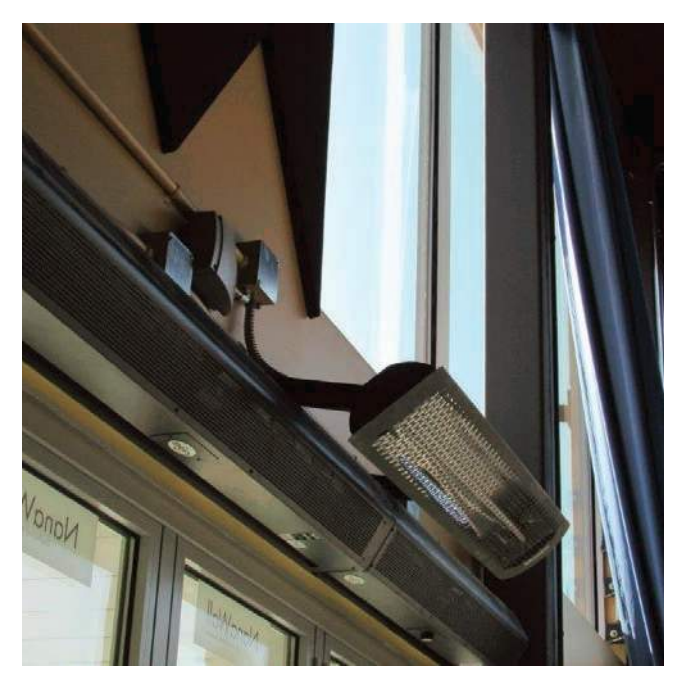
Air curtain example