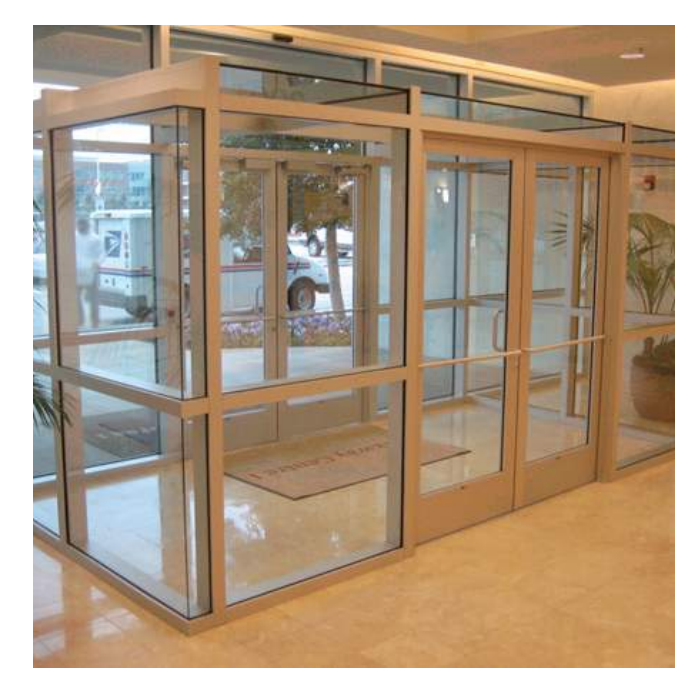
An example of an interior vestibule

Public entrances and high-traffic entrances are the intended doors where vestibules need to be included as part of the building design. Service doors or doors not used by the public are not the intended area for vestibules. Consider an example building with an entry space connected to corridors with a combined total area of 3,000 ft<sup>2</sup>. 2,700 ft<sup>2</sup> for the entry space and 300 ft<sup>2</sup> for the connected corridors; only those areas that cannot be closed off from the entrance door are to be included in the area total when determining if a vestibule is required.