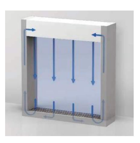
An example of a recirculating air curtain