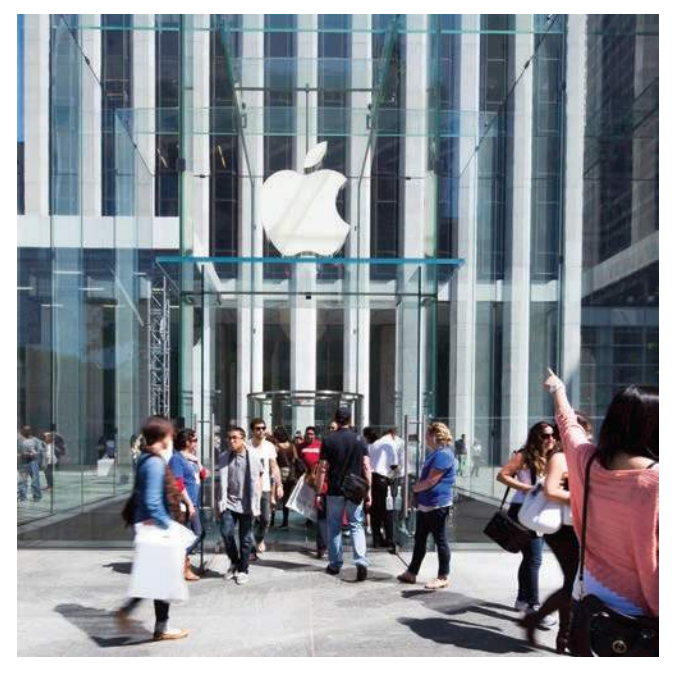
An example of an exterior vestibule