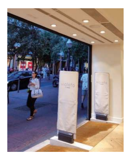
Example of a non-recirculating in-ceiling air curtain